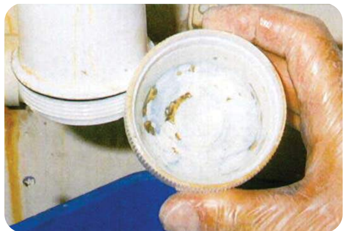
with Bio Blocks

Bio Blocks do not contain pDCB or other dangerous chemicals and are particularly suitable for use in public buildings, schools, institutions, hotels, pubs, clubs and restaurants. The pictures above show two urinal outlets after six months use - one using Bio Blocks, the other no blocks at all.