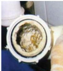
Pipework whilst using pDCB blocks

Before switching to Bio Blocks, the contractor charges for unblocking pipes ran into several hundred pounds. The results of the trial showed that Bio Blocks were able to keep the urinals clean and the pipe-work clear of any blockages providing substantial savings to the customer.