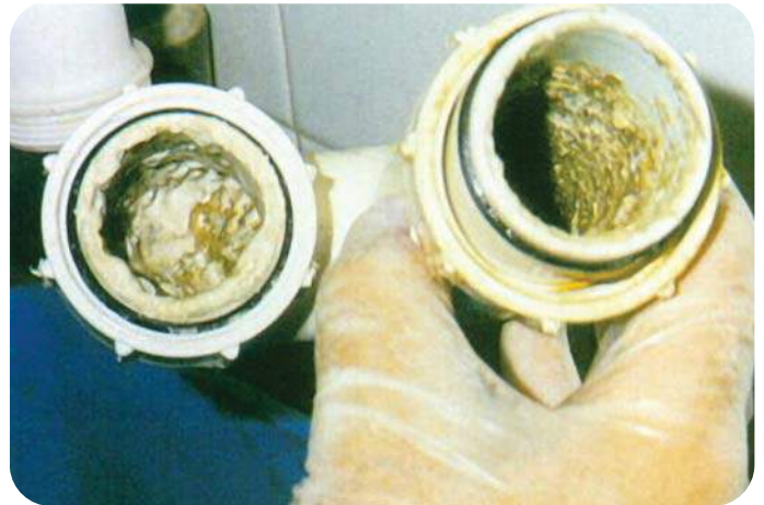
without Bio Blocks

Bio Blocks (not money) down your drains this year.