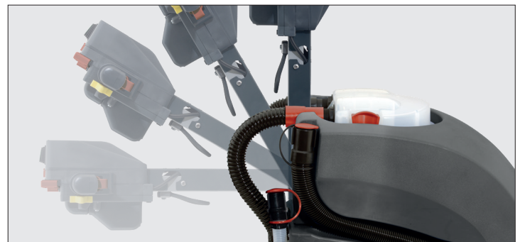
Fully Adjustable Handle